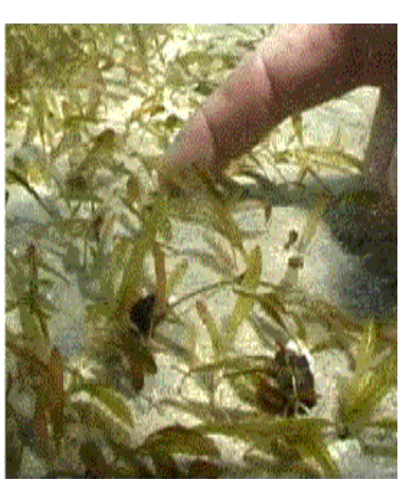
Halophila johnsonii.

Paddle grass is the only annual seagrass species, coming back from seeds every spring. Leaf blades are 1–2. 5 cm long and 3–6 mm wide and it can be found in very deep water with low light levels. It grows in water 30-100 ft (10–30 m) deep but has been found up to 280 ft (85 m) deep.