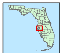
Tampa Bay, Florida